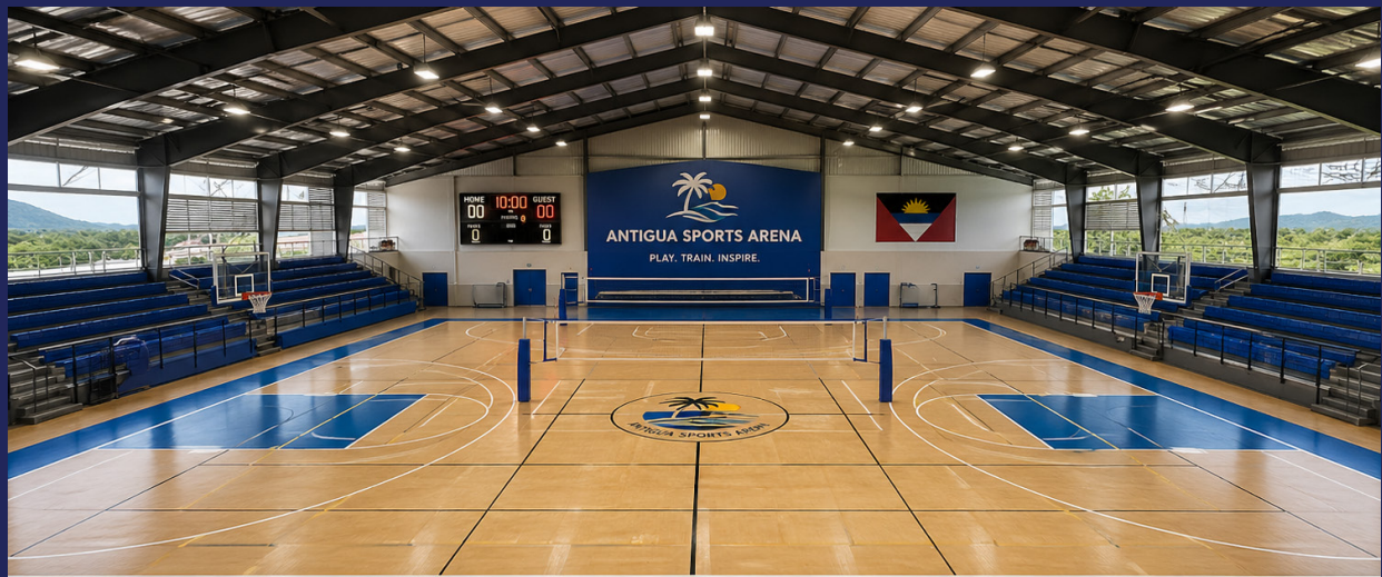
🌴 INDOOR VOLLEYBALL & BASKETBALL COURT – ANTIGUA 🌴